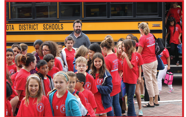
Sarasota students line up at their buses before entering the theatre.

Your donation of $125 or more, due by the date of our performance, helps to bring school children to the theatre. The Guild is a founding sponsor of Asolo Rep's Access to the Arts program. Each season, thousands of middle and high school students from Sarasota, Manatee and Charlotte counties attend special daytime performances by the repertory company.