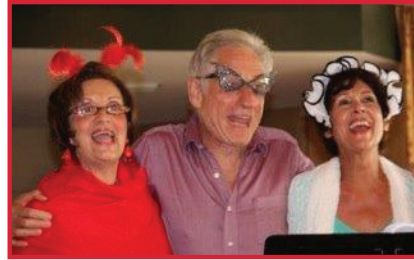
A presentation of "Fractured Fairy Tales."

At libraries, community group meetings, and residential complexes, we perform staged readings. Behind stands, with no sets, a few props, and minimal costuming, we impersonate charming and colorful characters.