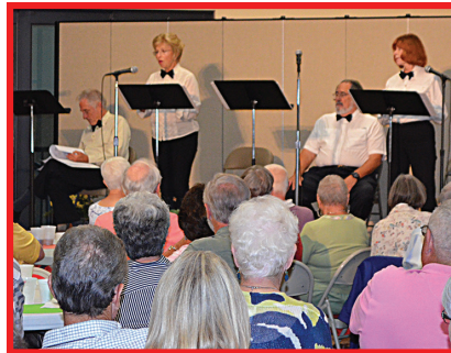
Play Readers thrill an audience of 180 listeners at Christ Church on Longboat Key.

Most of our presenters are former professional, semi-professional, and community theater actors. Some are just "hams" who have mainly retired from their day jobs and love the chance to emote before strangers.